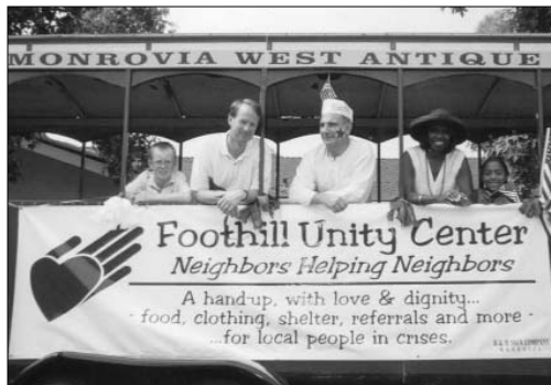
Directors, volunteers, staff, their children and grandchildren rode in the Sierra Madre Fourth of July Parade.