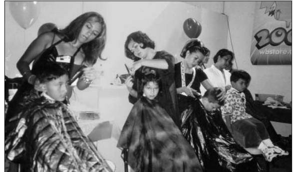
More haircuts for boys and girls.