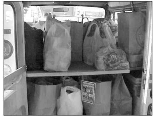
The mail trucks came loaded with food.

This food drive shows how well our community works together: the letter carriers with the idea and the transportation, the people of Monrovia and Duarte with their generosity, and the volunteers with their time. This is the perfect example of neighbors helping neighbors.