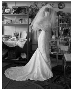
Left: Antiques, new and previously loved items are displayed. Right: Rainbow's End even has a good selection of bridal gowns (seconds and returns from manufacturer).