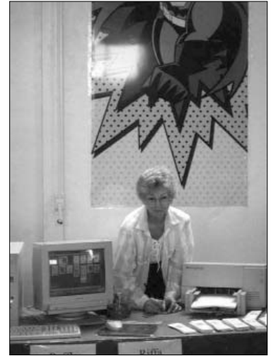
Every child had an opportunity to win a complete renovated computer system.