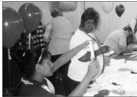
Children pick out their new socks.