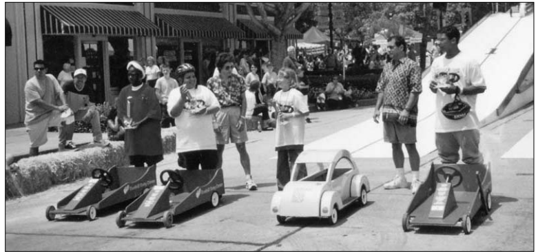
Foothill Unity Center kids take first, second and fourth place in Monrovia's Soapbox Classic.