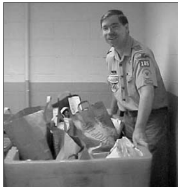
Scout leaders share in the effort.

We appreciate the extra effort of the letter carriers in both encouraging donations and picking up this large amount of food to help others. People throughout the two communities left donations of food by their mailboxes on that day and the letter carriers collected the donations. With assistance from community volunteers, the carriers unloaded the food at the post office.