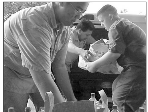
Scouts help letter carriers empty mail trucks.