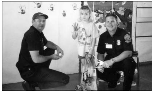
Firemen help children with handprints.