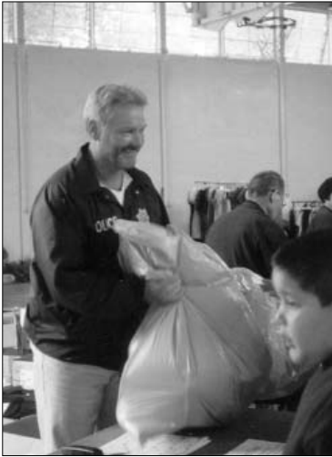
Kids check out with everything needed to start school.