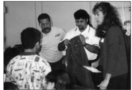
Children receive new uniforms.