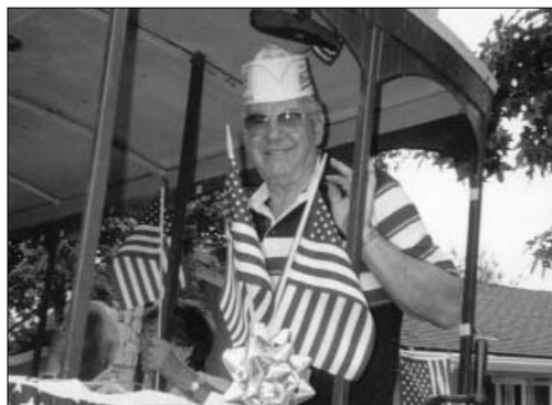
Krispy Kreme Donut hats and American flags were the uniform of the day.

And Buy Krispy Kremes they did! The center sold 168 dozen donuts. That is more than two thousand yummys. Feeding people donuts at local festivities has turned out to be a great way to raise the funds required to feed those in need in our communities.