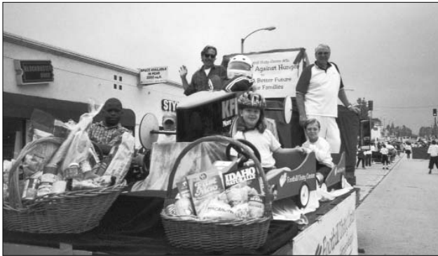
Racers and volunteers ride in the Monrovia Day Parade.