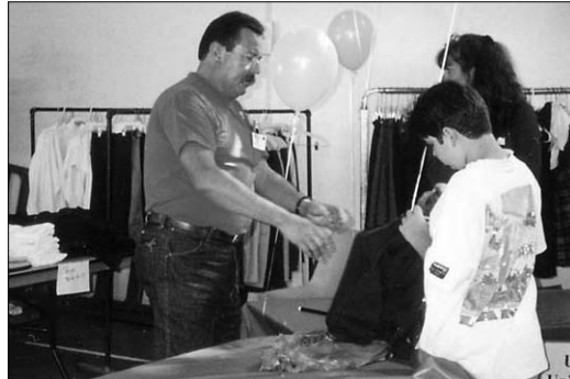
Each child also received part of a used uniform.