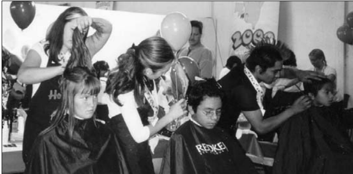
Over 300 children got professional haircuts.