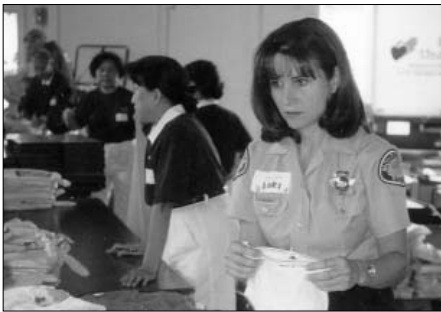
Volunteers help children select underwear.